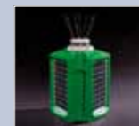
SC 155 II